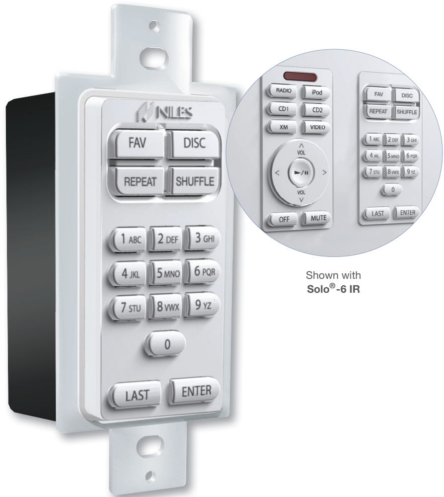
Shown with Solo®-6 IR